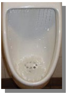
Left: Waterless urinal Right: Conventional urinals waste large volumes of water if they flush continuously

Urinals can waste water if they are set to flush continuously, if the radar/infra-red motion sensor malfunctions or if the motion detection sensor is activated by general bathroom traffic. Corrosion of solenoid valve seats can also cause leaks.